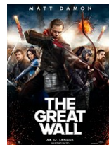
The Great Wall