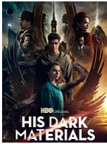
His Dark Materials