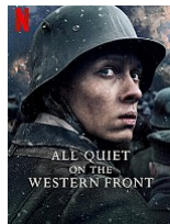
All Quiet on the Western Front