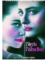
Birds of Paradise