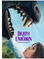
Death of a Unicorn