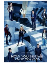
Now You See Me: Now You Don't