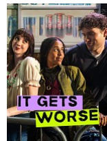
It Gets Worse